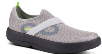
Men's OOmg Mesh