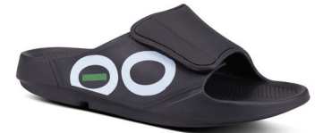
OOahh Sport Flex (Unisex)