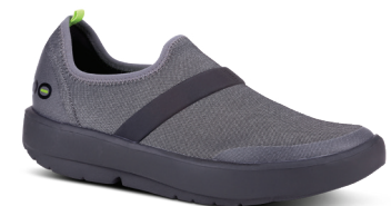
Women's OOmg Fibre